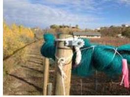
Side-Curtains gathered, overhead nets tied back for off-season.