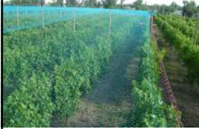
Notice the tall posts every single row, ideally no more than 50 feet apart.